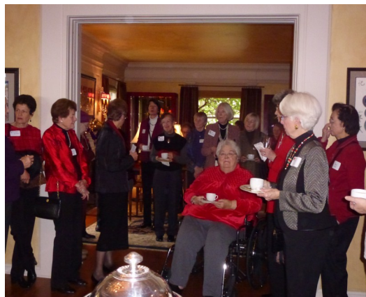
This photo was taken at the UW Alumni Association Volunteer Leadership Reception on 11-3-2012.